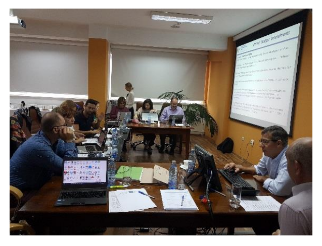
The second MENTOR meeting hosted by the Constanta Maritime University (CMU), Constanta, Romania, 18 October 2018

October also proved to be an eventful month, hosting the second MENTOR consortium meeting kindly held at the premises of the Constanta Maritime University (CMU) in Romania. The hospitality of the hosts and the superb meeting arrangements were complemented by a tour to the labs and simulator rooms of CMU.