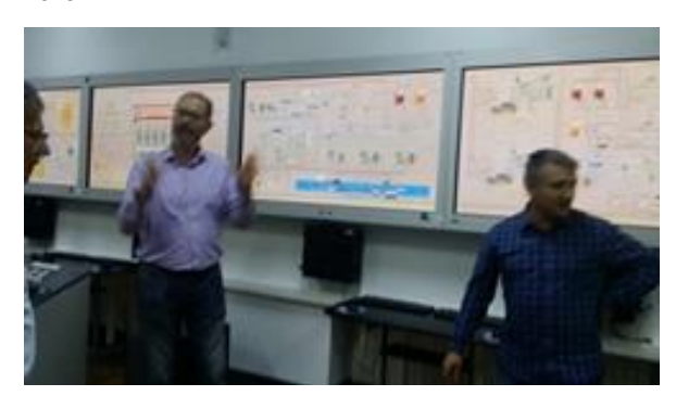
Visit to the Engine Simulator Room (CMU)

In addition, the second Blue Career Fair in Romania followed the Consortium meeting on October 19, where local business representatives presented numerous career opportunities to students, guests and interested parties. Ten Bulgarian students also visited this event and had the opportunity to get familiar with the available training