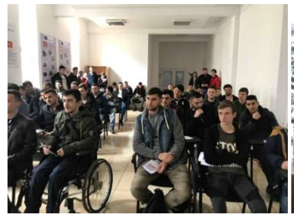
A visit at "Dimitrie Leonida" High School, Constanta, Romania, 14th March 2018, organized by Constanta Maritime University (CMU)

pupils. After the events, the interested students were prompted to provide their contact details so that they could be invited for future happenings and to be further advised on the forthcoming MENTOR e-learning courses to be developed within the project.