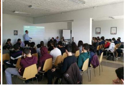
A visit at "Costeas - Geitonas" School, 15th March 2018, organized by The National Technical University of Athens, Greece (NTUA)

Other interesting and innovative approaches to reach young audiences were employed by MARINEM & AUA. On 4th May 2018 a member of MARINEM was invited to deliver a speech and share and impart his knowledge in relation to the shipping industry at the YoungShip LAW social event at Diamante Blu, a high end café lounge bar and a subsidiary operation of the Demetriades Group in Cyprus. In the ambience of the old port of Limassol, next to the marina, this event aimed at raising awareness among the younger generation with regard to the maritime industry, the opportunities of a sea or ashore based career. A member of AUA attended an exhibition of student projects, entitled "The EPAL creates" in a form of a Multipurpose Room in the "Constitution" Metro Station, Athens, Greece, 7th - 10th February 2018. AUA presented a poster for the MENTOR project in the Agriculture section, distributed flyers and leaflets, and ran a short video in Greek for a video wall.